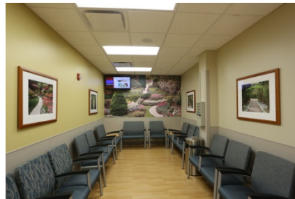
Wall Mural & Framed Art in Emergency Waiting Area