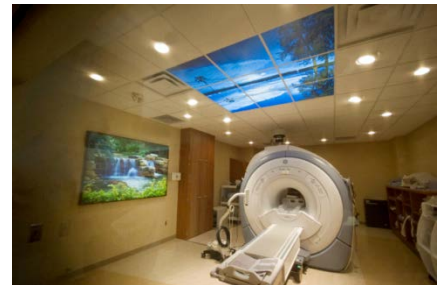
PhotoLight™ Ceiling & Wall Panels in MRI room