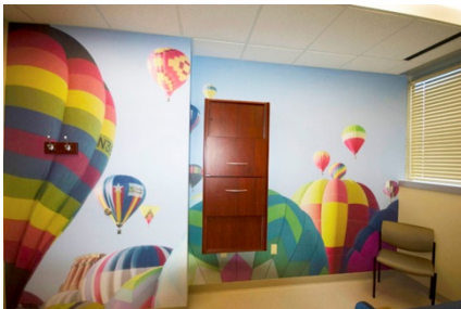
Wall Mural in Pediatric Exam room