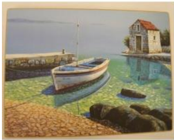
Frameless , no-cover artwork Designers Art of California (DAC)